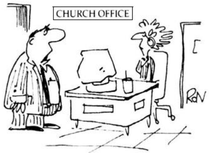
"If telemarketers call, invite them to church."

D ue to increased popularity, we are pleased to announce that our Free Community Lunch Ministry will now be held year round on the 2nd and 4th Tuesday of each month.